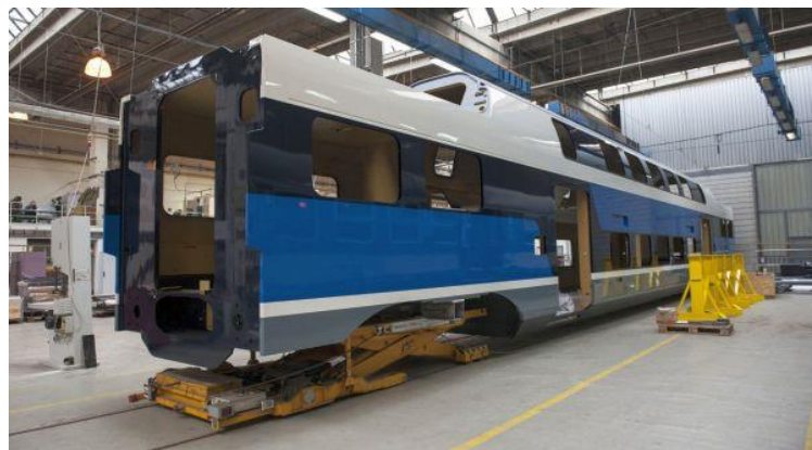
Carbody before assembly of a KISS train for MAV

From the latest delivery framework agreement for 40 KISS double deck trains, signed in August 2017 between Stadler and MAV Start, 11 units were immediately firm ordered. AIL Structured Finance again elaborated a tailormade payment security scheme for the scope of the entire framework agreement. Consequently, ALLSF at that time approached the